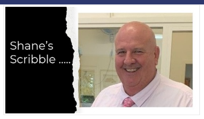
Term 3 - Week 8: